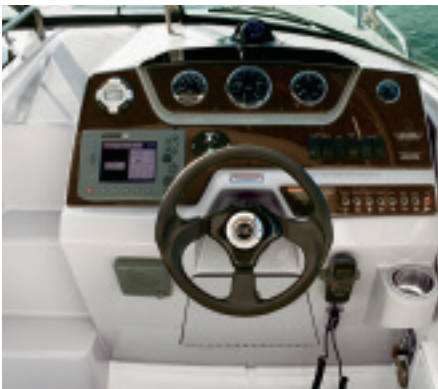
This handsome new black coral and burl control station is fully equipped with custom Sea Ray SmartCraft™ instruments.

The sleek, contemporary lines of the new 270 Sundancer make it a standout in any marina, but this express cruiser is not meant to sit at the dock. A dynamic deep V-hull provides a smooth ride in any conditions, while the stylish interior promises comfortable overnight stays.