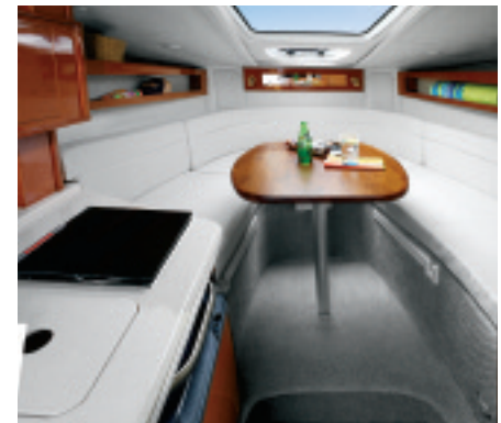
Rich textures and designer fabrics make this roomy V-berth attractive and comfortable.

Sea Ray Boats, 2600 Sea Ray Blvd., Knoxville, TN 37914. For information fax 1-636-326-3282. Internet address: http://www.searay.com