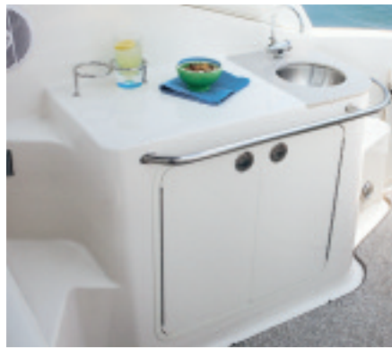
The elegant cockpit wet bar features Corian® countertop and stainless-steel faucet.