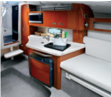
The tastefully appointed galley comes well equipped with a molded-in sink, dual-voltage refrigerator, microwave, and butane stove.