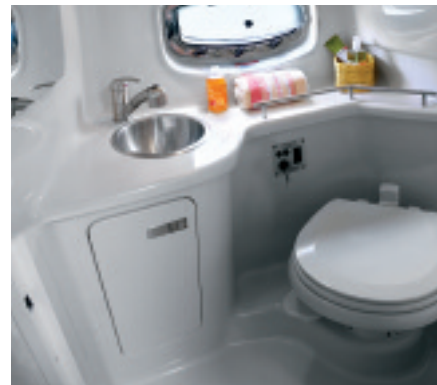
A comfortable head and shower compartment is fully enclosed and features a sink, vanity, and VacuFlush® head.