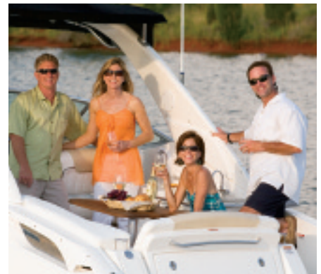
Comfort comes standard with this luxurious and open cockpit designed for sunning and entertaining.