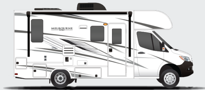
Standard Graphics Package