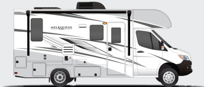
Optional Partial Paint