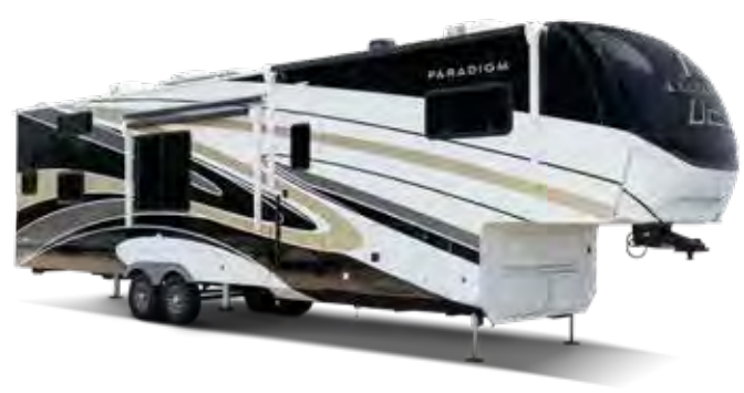
Full Body Paint Option Gold