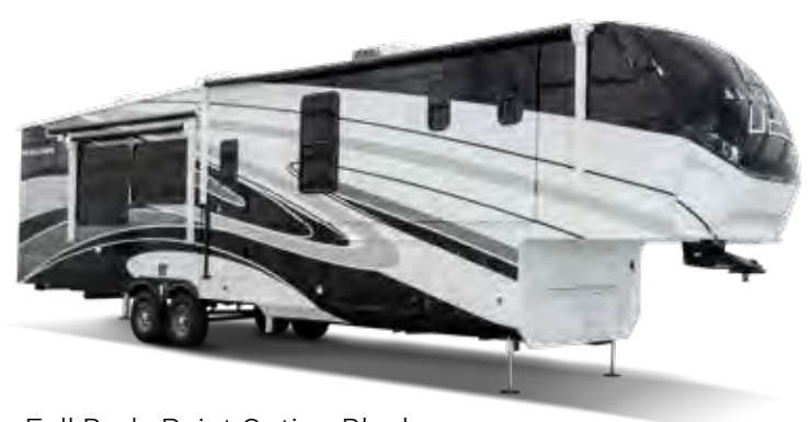
Full Body Paint Option Black